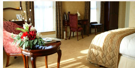
774 Spacious Guest Rooms & Suites

Citywest Hotel, Conference, Leisure & Golf Resort Saggart, Co. Dublin