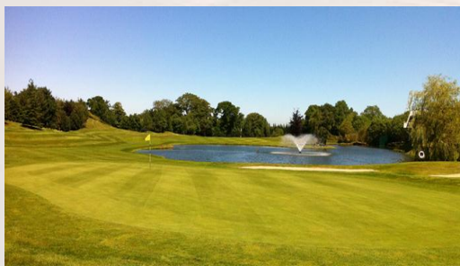
18 Hole Championship Golf Course