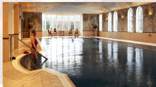
Health & Leisure Club